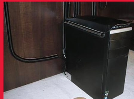
After Grip Strip™